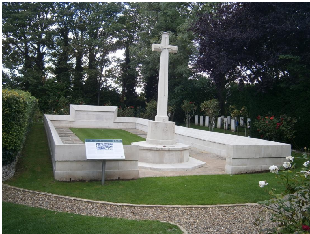
Cross of Sacrifice - All Souls Cemetery, Kensal Green