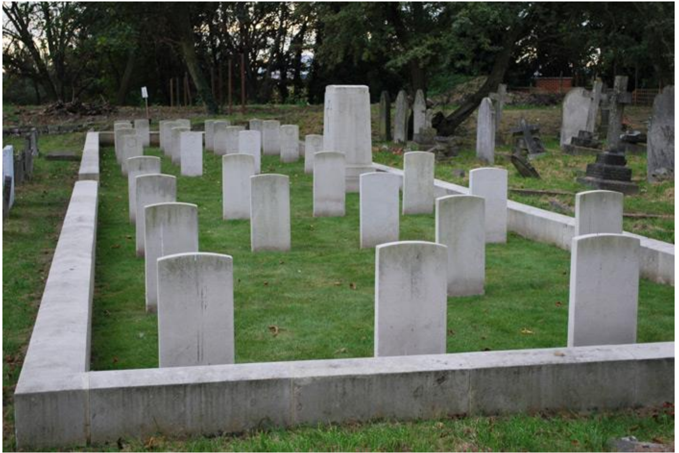
All Souls Cemetery, Kensal Green