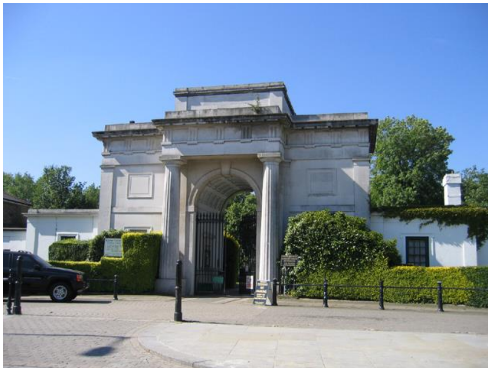
All Souls Cemetery, Kensal Green